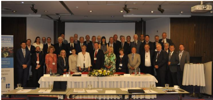
67 th ECCE General Meeting group photo

under the umbrella of the ECCE Initiative “2018 European Year of Civil Engineers” .