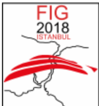
FIG General Assembly 2018 - short report

At the General Assembly there were election for the new president for the term 2019-2022, two vice presidents, commission chairs and the destination for the FIG Congress 2022. A short report is available on the web site - further photos will be added soon. The minutes will be uploaded soon, too.