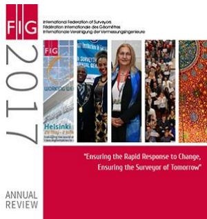
FIG Annual Review 2017

http://fig.net/news/news_2018/05_Guide_Valuation_unregistered_Land.asp