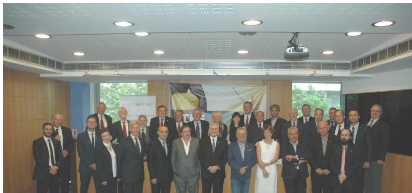
64 th ECCE GM participants

The 64 th ECCE General Meeting was held on 20 th – 22 nd October 2016, in Athens, Greece, hosted by the Civil Engineers Association of Greece (ACEG) and the Technical Chamber of Greece (TCG). The Round Table “Building the future: The road to prosperity is always under construction” was held on 20 th October 2016, organized by ACEG, TCG and ECCE, in the context of the 64 th ECCE GM.