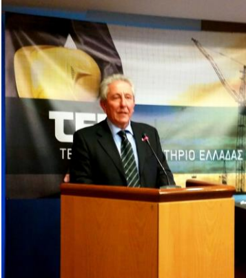
New ECCE President inaugural speech

Council vis-à-vis other engineering and non- engineering associations, that share our transnational and cultural patrimony.”