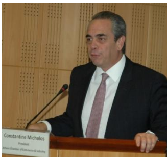
Constantine Michalos President, Athens Chamber of Commerce & Industry

He referred to the progress made in implementing an integrated operational plan for Athens' sustainable development. He highlighted the discontinuity of the state, due to the frequent changes of the Ministries' Political Superiors, as a key problem, mentioning the example of Italy where the continuity of the State is ensured by the municipalities and regions. He also stressed the need for cooperation with the Central Government, the Region, the Universities and Chambers. He added that Athens had the chance to have the full European Commission support.