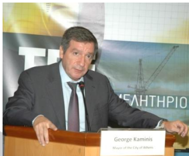
George Kaminis Mayor of Athens City

He noted that the difficulty in accessing funding, is perhaps the most serious, but not the only reason for the low investment activity in Greece, while the over taxation is keeping the investors away. He also stated that delaying the necessary economic reforms, the inefficiency of public administration and a hostile regulatory and tax environment hold back the economic competitiveness.