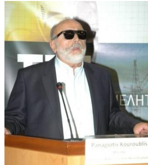
Panagiotis Kouroumbilis Minister of Interior & Administrative Reconstruction

He analyzed the significance of Juncker's Plan for resource mobilization, and noted the need to reconcile private, community and public investment through intelligent financial tools to overcome the current financial constraints in the country and help the economy to restart. However, as TCG's President noted, many things have to be changed in the country in order to attract private investments. He also emphasized the topic of friendly business environment and made eight specific proposals having immediate effect to facilitate any kind of investment.