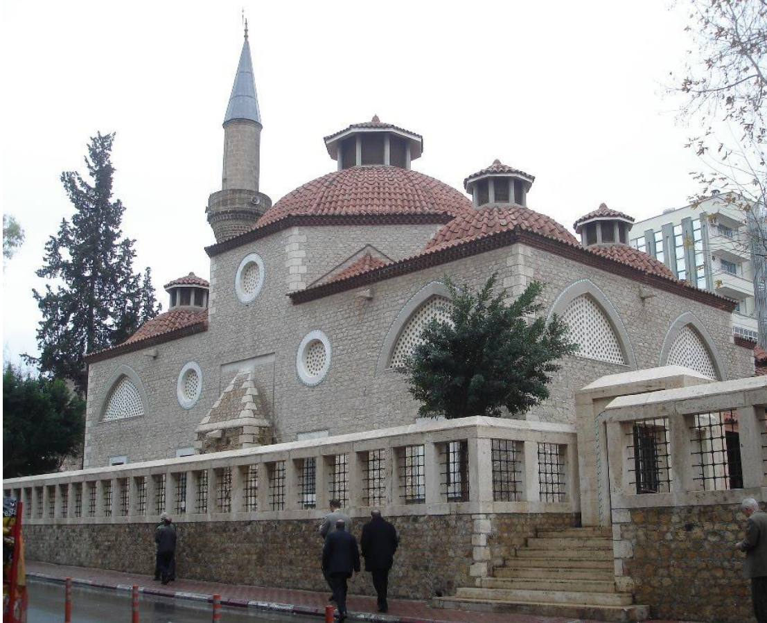
Karakaş Mosque, Antalya, Turkey by architect Turgut Cansever (1920-2009)